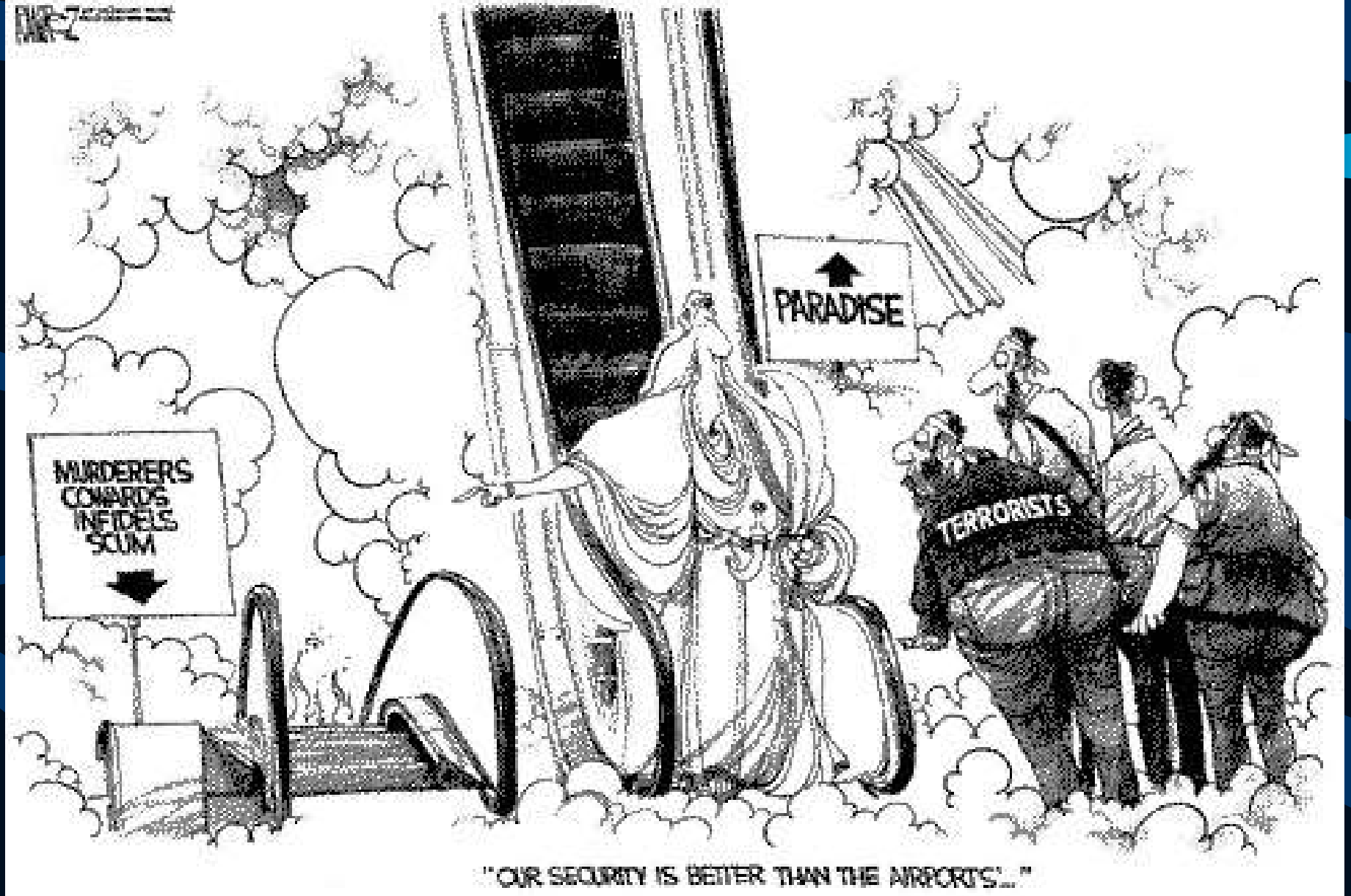
"OUR SECURITY IS BETTER THAN THE AIRPORTS..."